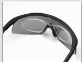
Optional Rx Carrier