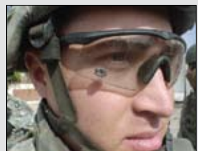
Lt. A's eyesight was saved by the Sawfly System