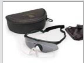
U.S. Military Kit